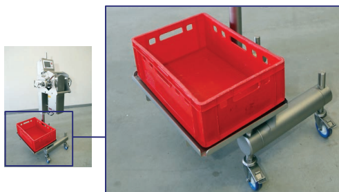
Holder for E2 crates